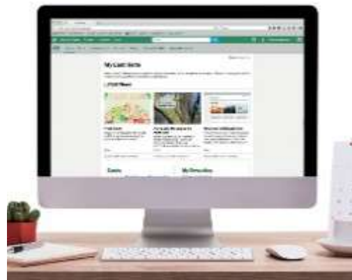
Latest news & blogs